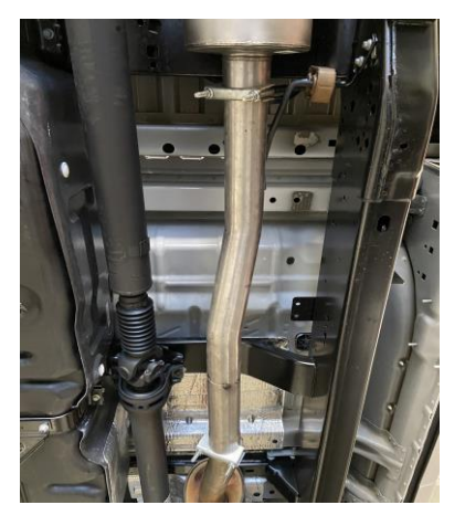
3. INSTALL HEADPIPE #A ONTO STOCK PIPE BEHIND RESONATOR. INSERT WELDED HANGER INTO RUBBER GROMMET. USE CLAMP #D PROVIDED TO SECURE. DO NOT TIGHTEN.