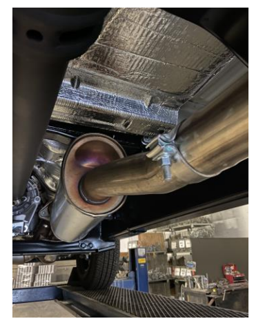
2. TO REMOVE YOUR STOCK EXHAUST, REMOVE IT FROM THE CLAMP LOCATED JUST IN FRONT OF THE RESONATOR. REMOVE HANGERS FROM RUBBER GROMMETS, USE WD-40 TO AID IN REMOVAL, LEAVE GROMMETS IN PLACE.

1. Disconnect the negative battery cable before removal of OEM exhaust. This will allow the computer to reset and recognize the new exhaust. Lay out the exhaust on the floor so it looks like the drawing and compare parts with manual.