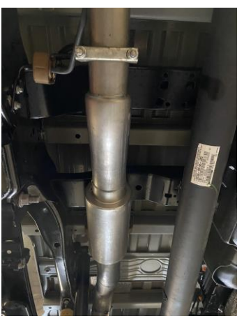
4. INSTALL MUFFLER #B ONTO HEADPIPE, USE CLAMP #D TO SECURE MUFFLER TO HEADPIPE. DO NOT TIGHTEN. USE A JACK STAND TO HOLD UP THE MUFFLER. OUTLETS SHOULD BE LEVEL.