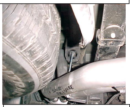
4 INSTALL PASS. SIDE TAILPIPE # C INTO MUFFLER 1 ½" TO 2". INSERT HANGER INTO RUBBER GROMMET, USE CLAMP # G TO SECURE PIPE TO MUFFLER. DO NOT TIGHTEN.