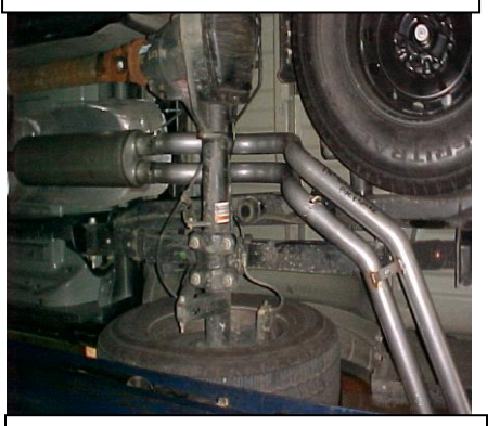
6. THE TAB ON DRIVER SIDE PIPE SHOULD GO UNDERNEATH THE PASSENGER SIDE PIPE TAB. USE BOLT KIT # H TO SECURE TOGETHER.