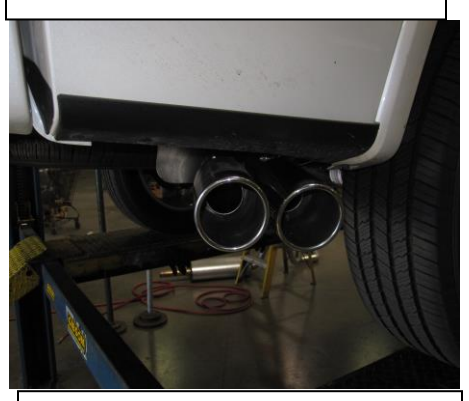
7. Be sure to check all clearance after each section has been tightened to be sure there is proper clearance. It may take 4-500 miles for your vehicle to fully adjust to the changes in exhaust flow.

"MAKE SURE YOU HAVE A 1" CLEARANCE ON ALL PIPES FROM ALL RUBBER BRAKE LINES, SHOCK BOOTS, TIRES, ETC..." TORQUE ALL CLAMPS TO APPROX. 100 TO 150 FT LBS.