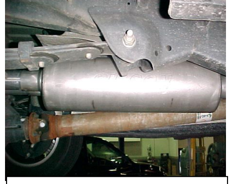
3 INSTALL MUFFLER # B ONTO HEADPIPE 1 ½″ TO 2″. USE CLAMP # F TO SECURE MUFFLER TO HEADPIPE. DO NOT TIGHTEN. USE A JACK