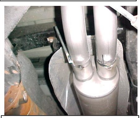
5. INSTALL DRIVERS SIDE TAILPIPE # D INTO MUFFLER 1 ½" TO 2". INSERT HANGERS INTO RUBBER GROMMETS, USE CLAMP # G TO SECURE PIPE TO MUFFLER. DO NOT TIGHTEN.