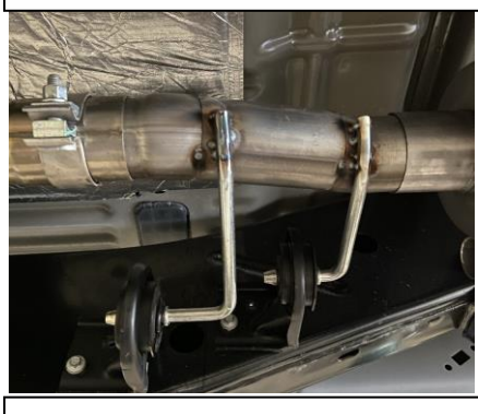
2. INSTALL HEADPIPE #A ONTO STOCK FLANGE. INSERT WELDED HANGER INTO RUBBER GROMMET. USE BOLT KIT PROVIDED TO SECURE. DO NOT TIGHTEN

1. Disconnect the negative battery cable before removal of the OEM Exhaust. This will allow the computer to reset and recognize the new exhaust. Lay out the exhaust on the floor so it looks like the drawing and compare parts with manual. Remove the factory exhaust by cutting behind the factory muffler. Once the tail pipe has been removed un-bolt the muffler and head pipe at the clamp located in front of the factory muffler. Use wd-40 or another type of penetrating oil to remove the rubber grommets. Do not damage these they will be re used.