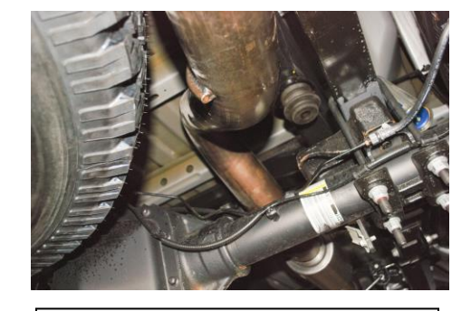
from spare tire install the exhaust tip onto the tailpipe. The system was designed to have the tip 1" below the quarter panel of the vehicle. With the tip in your desired position begin to tighten down all clamp connections from the