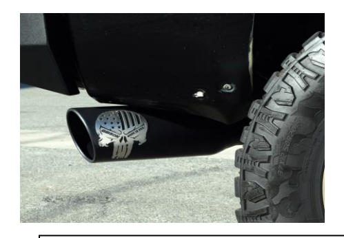
7. Be sure to check all clearance after each section has been tightened to be sure there is proper clearance. It may take 4-500 miles for your vehicle to fully adjust to the changes in exhaust flow.

"MAKE SURE YOU HAVE A 1" CLEARANCE ON ALL PIPES FROM ALL RUBBER BRAKE LINES, SHOCK BOOTS, TIRES, ETC..." TORQUE ALL CLAMPS TO APPROX. 100 TO 150 FT LBS.