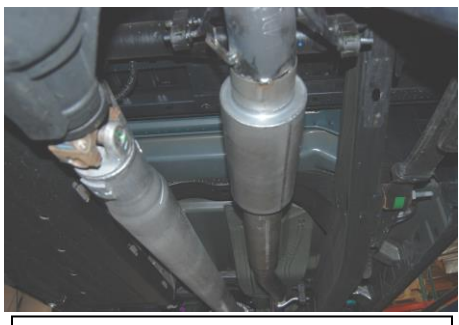
4. Install over axle pipe Item # C into the muffler outlet. Slip the hangers into the rubber grommets and keep tailpipe loose.