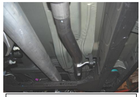
3. Install muffler assembly Item # B onto the head pipe. You may need to use a jack stand to support the muffler while installing the tailpipe. Use Item# E to clamp the muffler assembly to the head pipe. Loosely tighten