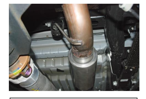
5. With everything loose you may need to adjust the system for proper clearance of shocks, brake lines, ect.