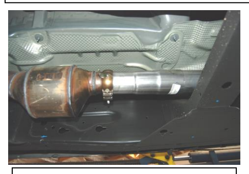
2. Install Head pipe Item # A onto the factory flange. You will re use the factory clamp at this connection. Loosely tighten down the clamp.

1. Disconnect the negative battery cable before removal of the OEM Exhaust. This will allow the computer to reset and recognize the new exhaust. Lay out the exhaust on the floor so it looks like the drawing and compare parts with manual. Remove the factory exhaust by cutting behind the factory muffler. Once the tail pipe has been removed un-bolt the muffler and head pipe at the flange located behind the catalytic converter. Use wd-40 or another type of penetrating oil to remove the rubber grommets. Do not damage these they will be re used.