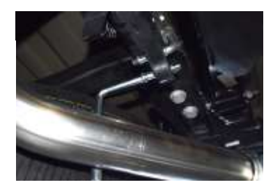
6. Install the driverside overaxle tailpipe #D into the muffler 1½-2". Use clamp #H to secure. DO NOT TIGHTEN. Rotate until it meets with the rubber grommet. DO NOT TIGHTEN.

2. Install head pipe #A onto your existing stock front pipe and attach with clamp #G. Insert welded hanger into rubber grommet.