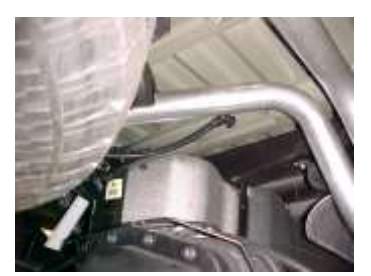
INSTALL DRIVERS SIDE TAILPIPE # D INTO MUFFLER 1 ½" TO 2". INSERT WELDED HANGERS INTO RUBBER GROMMETS. USE CLAMP # H TO SECURE PIPE TO MUFFLER, DO NOT TIGHTEN.

TO REMOVE YOUR STOCK EXHAUST, MEASURE 6" FROM THE 2-BOLT FLANGE LOCATED IN FRONT OF YOUR STOCK MUFFLER AND CUT.