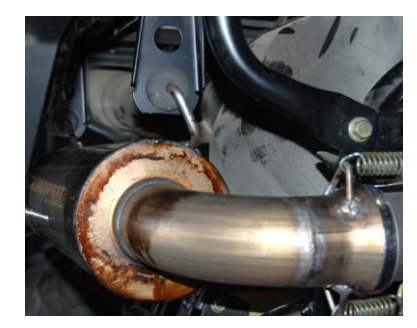
5. Install the factory gasket onto the original header.

6. Install Item #A slide the hangers in factory mounts from the passenger side until lined up with the header. Once you have it lined up re install the factory springs.