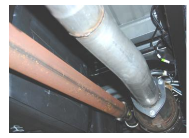
3. Install headpipe #A onto your existing stock front pipe Re-using the factory nuts.

6. Install the driver side hanger #H using a factory bolt location and bolt. The bolt is the lower left bolt that mounts your overlaod bump stop to the outside of the from rail rear of the axle on the driver side. Install and keep loose until final fitment.