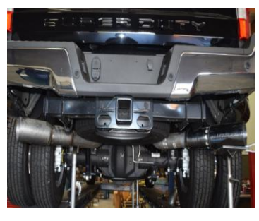
7. Install both the driver side and passenger side exit pipes. Use a jack stand to support the tips up while you make final adjustments to find the perfect fit. Adjust the kit to fit properly giving at least 1.5" of clearance from all components. Begin to tighten the system from the frot forward. Be sure after each connection is tightening to go back and check your tip position as it can move.

Use stainless steel cleaner to prevent tip from discoloration, Inspect all fasteners after 25-50 miles & retighten as necessary