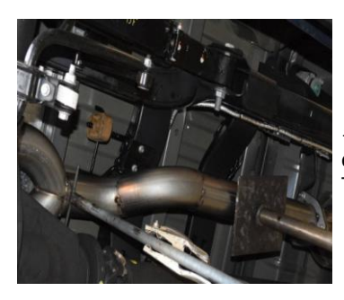
4. Install the Extension Y-pipe #B onto headpipe 1.5"-2". Use clamp #G to secure. Do not Tighten