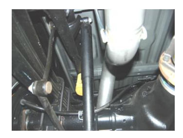
5. Install the over axle tailpipe #B onto headpipe 1.5"-2". Use clamp #D to secure. Do not Tighten

5. Adjust to fit properly then tighten all clamps and bolts. Use stainless steel cleaner to prevent tip from discoloration, Inspect all fasteners after 25-50 miles & retighten as necessary