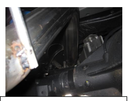
5. With everything loose you may need to adjust the system for proper clearance of shocks, brake lines, ect.