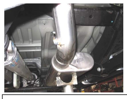
4. Install over axle pipe Item # C into the muffler outlet. Slip the hangers into the rubber grommets and keep tailpipe loose use clamp #E to secure together.