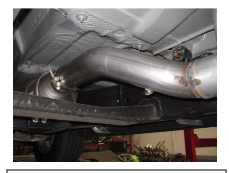
1.Install headpipe #A onto your factory pipe using your stock clamp insert welded hanger into the rubber grommet leave clamp loose.

1. Disconnect the negative battery cable before removal of the OEM Exhaust. This will allow the computer to reset and recognize the new exhaust. Lay out the exhaust on the floor so it looks like the drawing and compare parts with manual. Remove the factory exhaust by cutting behind the factory muffler. Once the tail pipe has been removed un-bolt the muffler and head pipe at the clamp located in front of the factory muffler. Use wd-40 or another type of penetrating oil to remove the rubber grommets. Do not damage these they will be re used.