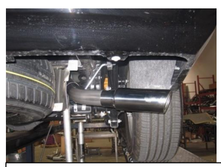
7. Be sure to check all clearance after each section has been tightened to be sure there is proper clearance. It may take 4-500 miles for your vehicle to fully adjust to the changes in exhaust flow.

"MAKE SURE YOU HAVE A 1" CLEARANCE ON ALL PIPES FROM ALL RUBBER BRAKE LINES, SHOCK BOOTS, TIRES, ETC..." TORQUE ALL CLAMPS TO APPROX. 100 TO 150 FT LBS.