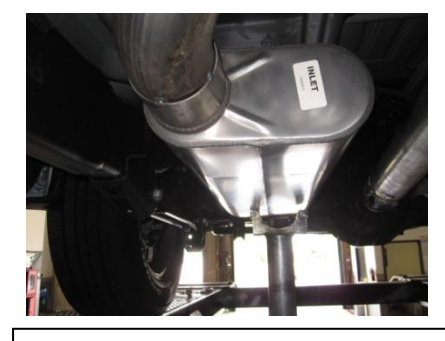
3. Install muffler #B onto headpipe 1.5" to 2" muffler should be level use clamp #E to secure together do not tighten.