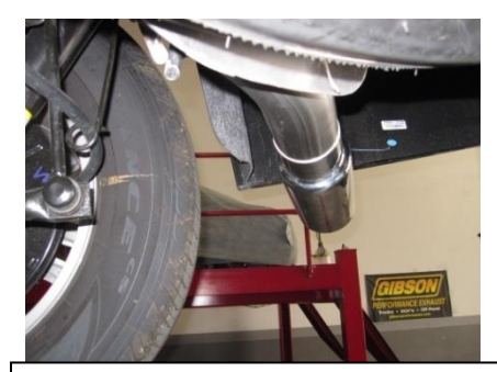
6. With proper clearance from spare tire install the exhaust tip onto the tailpipe. The system was designed to have the tip 1" below the quarter panel of the vehicle. With the tip in your desired position begin to tighten down all clamp connections from the