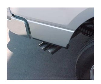
INSTALL YOUR STAINLESS TIPS TO YOUR DESIRED LOOK. NOW GO BACK AND TIGHTEN ALL CLAMPS FROM THE FRONT WORKING YOUR WAY BACK.

INSTALL MUFFLER # B ONTO HEADPIPE 1 \frac{1}{2} " TO 2". USE CLAMP # F TO SECURE MUFFLER TO HEADPIPE. DO NOT TIGHTEN. USE A JACK STAND TO HOLD UP THE MUFFLER. OUTLETS SHOULD BE LEVEL.