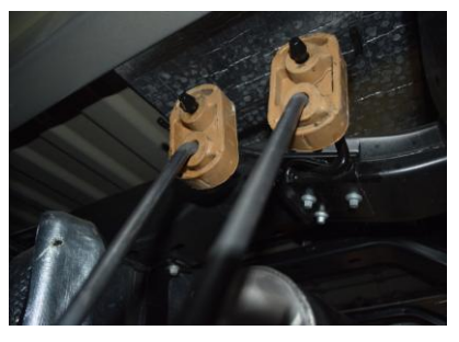
4. INSTALL OVERAXLE TAILPIPE # C INTO THE OUTLET OF THE MUFFLER 1<sup>1</sup>/<sub>2</sub>" TO 2". INSERT WELDED HANGERS INTO THE FACTORY RUBBER GROMMET. USE CLAMP #E TO ATTACH THE OVERAXLE PIPE TO THE MUFFLER OUTLET. DO NOT TIGHTEN.

3. INSTALL MUFFLER # B. ONTO HEADPIPE 1½" TO 2". USE CLAMP #E TO SECURE MUFFLER TO HEADPIPE. DO NOT TIGHTEN