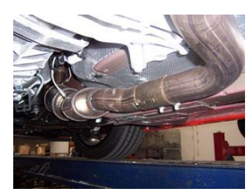
2.Remove the whole exhaust from the clamps (located just after your factory headers). To make it easier, remove the support in the middle of the car. Do Not Disgard. You will reinstall.

1. Disconnect the negative battery cable before removal of OEM exhaust. This will allow the computer to reset and recognize the new exhaust. Lay out the exhaust on the floor so it looks like the drawing and compare parts with manual.