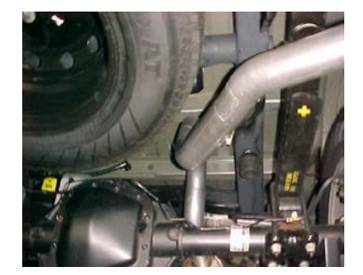
INSTALL OVERAXLE TAILPIPE #C INTO MUFFLER 1 ½" TO 2". INSERT HANGERS INTO RUBBER GROMMETS.USE CLAMP #E TO SECURE PIPE TO MUFFLER.DO NOT TIGHTEN.

TO REMOVE YOUR STOCK EXHAUST, REMOVE IT FROM THE CLAMP LOCATED JUST IN FRONT OF THE MUFFLER AND REMOVE HANGERS FROM RUBBER GROMMETS BY PULLING EXHAUST TOWARDS THE REAR OF THE VEHICLE, USE WD-40 TO AID IN REMOVAL, LEAVE GROMMETS IN PLACE.