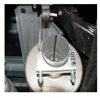
USE HANGER #F AT THE REAR OF THE MUFFLER WITH VERTICAL BAR OF HANGER ON PASSENGER SIDEAND INSERT WELDED ROD INTO RUBBER GROMMET. DO NOT TIGHTEN.