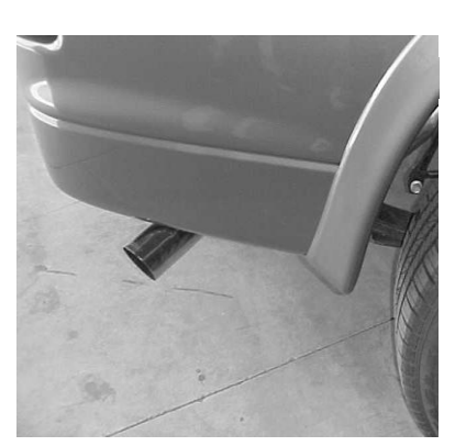
NOW INSTALL YOUR STAINLESS STEEL TIP. USE ANY ALUMINUM OR STAINLESS STEEL CLEANER TO POLISH YOUR TIP.

MAKE SURE YOU HAVE MINIMUM OF 1" CLEARANCE FROM ALL FUEL LINES, BRAKE LINES, SHOCK BOOTS, TIRES, ETC.