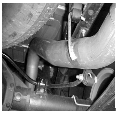
INSTALL THE OVER AXLE PIPE #C INTO MUFFLER NO LESS THEN 1-1/2" AND NO MORE THAN 2" .SLIP REAR WELDED HANGER INTO THE FACTORY RUBBER GROMMET. ATTACH TO MUFFLER WITH CLAMP #H.

UN-CLAMP THE STOCK EXHAUST IN FRONT OF YOUR MUFFLER AND REMOVE. FOR AN EASIER REMOVAL OF THE EXHAUST CUT THE TAIL PIPE BEHIND THE STOCK MUFFLER. SLIDE HEADPIPE #A ON TO THE STOCK CONNECTOR PIPE. USE CLAMP #G TO ATTACH IT. DO NOT TIGHTEN. RAISE THE VEHICLE UP AND SUPPORT IT WITH A JACKSTAND. LEAVE ALL FACTORY RUBBER GROMMETS IN PLACE.