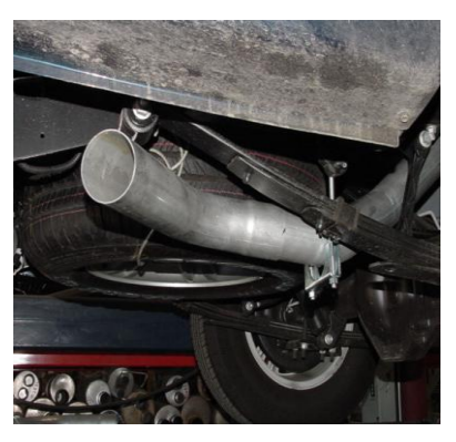
INSTALL EXIT PIPE #D USING CLAMP #H TO ATTACH TO THE OVER AXLE PIPE. DO NOT TIGHTEN. ROTATE PIPES UNTIL EVERYTHING IS LEVEL. ONCE YOU HAVE EVERY THING IN POSITION THEN TIGHTEN ALL CLAMPS AND HANGERS.

SLIDE MUFFLER WITH BAFFLES FACING FORWARD TOWARDS CONVERTER ONTO THE HEADPIPE NO LESS THEN 1<sup>1</sup>/<sub>2</sub>" AND NO MORE THAN 2". MUFFLER INLET IS LOOKING INTO LOUVERS.