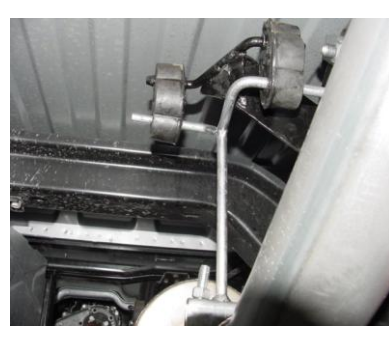
INSTALL HANGER #H AS PROVIDED. VERTICAL ROD ON HANGER #H SHOULD BE TO THE LEFT OF THE CENTER OF THE MUFFLER.