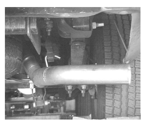
INSERT EXITPIPE #E ONTO TAILPIPE. INSERT WELDED HANGER INTO RUBBER GROMMET. USE CLAMP #F TO SECURE EXITPIPE TO TAILPIPE, DO NOT TIGHTEN. ROLL THE EXIT PIPE UNTIL IT IS LEVEL.

INSTALL HEADPIPE #A ONTO STOCK FLANGE USING THE FACTORY BOLT TO SECURE IT. DO NOT TIGHTEN. NEXT INSTALL HEADPIPE #B ONTO #A HEADPIPE YOU WILL USE CLAMP #F TO SECURE HEADPIPE #A TO #B, DO NOT TIGHTEN. INSERT WELDED HANGER INTO RUBBER GROMMET.