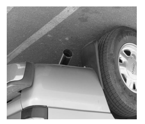
NOW, GO BACK AND TIGHTEN ALL NUTS, BOLTS AND CLAMPS, STARTING FROM THE FRONT AND WORKING BACK. INSTALL YOUR STAINLESS STEEL TIP. TO CLEAN TIP USE A SCOTCH BRITE PAD AND ANY STAINLESS OR ALUMINUM CLEANER.

INSTALL MUFFLER #C ONTO HEADPIPE. OUTLET SHOULD BE AT THE 11 O'CLOCK POSITION. USE CLAMP #F TO SECURE MUFFLER TO THE HEADPIPE, DO NOT TIGHTEN. USE A JACK STAND TO SUPPORT MUFFLER. INLET OF MUFFLER IS LOOKING INTO LOUVERS.