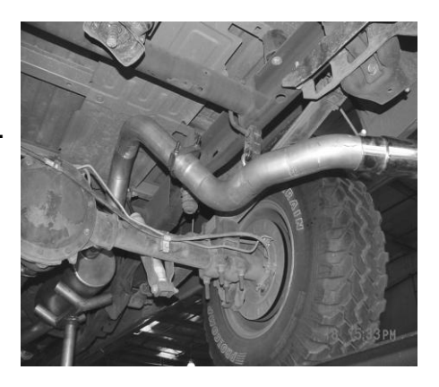
INSTALL OVERAXLE TAILPIPE #D INTO MUFFLER. INSERT WELDED HANGER INTO RUBBER GROMMET. USE CLAMP #F TO SECURE PIPE TO MUFFLER, DO NOT TIGHTEN.

TO REMOVE THE STOCK EXHAUST UN-BOLT IT FROM THE 2-BOLT FLANGE LOCATED JUST BEHIND THE FACTORY Y-PIPE. YOU WILL NEED TO RE-USE THE FACTORY BOLTS. NOW CUT OFF YOUR STOCK TAILPIPE JUST BEHIND THE MUFFLER AND REMOVE. LEAVE ALL RUBBER GROMMETS ON THE HANGERS. USE WD-40 TO AID IN REMOVAL OF THE