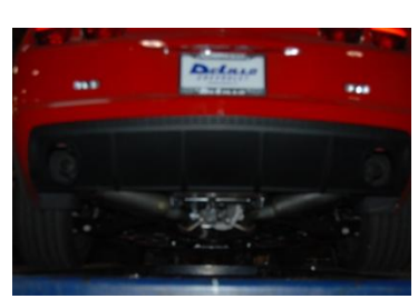
5. Install stainless tips. Use stainless steel cleaner and a Scotch Brite pad weekly to prevent tip from discoloration.

Next install #A x-pipe onto your stock pipes re-using your factory clamps leaving loose until the whole exhaust is installed.