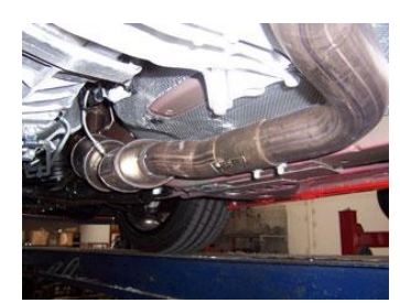
2.Remove the whole exhaust from the clamps (located just after your factory headers). To make it easier, remove the support in the middle of the car. Do Not Disgard. You will reinstall.

1. Disconnect the negative battery cable before removal of OEM exhaust. This will allow the computer to reset and recognize the new exhaust. Lay out the exhaust on the floor so it looks like the drawing and compare parts with manual.