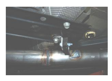
3. Install your X-Pipe using the factory clamps. Bolt the support back in. You will bolt the X-Pipe to it then bolt the other hanger to the chassis with supplied bolts