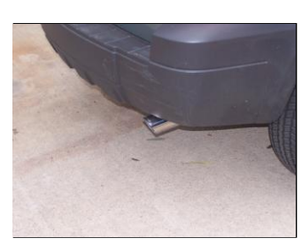
6. Install stainless steel tips #E. Clamp down. When you have everything in place, firmly tighten all bolts and clamps down securely. Use stainless steel cleaner and a Scotch Brite pad weekly to prevent tip from discoloration.

3. Install muffler #B onto head pipe 1½"-2" with the louvers facing towards the converter. Use a jack stand to support the muffler. Use clamp #F to secure the muffler to the headpipe. DO NOT TIGHTEN.