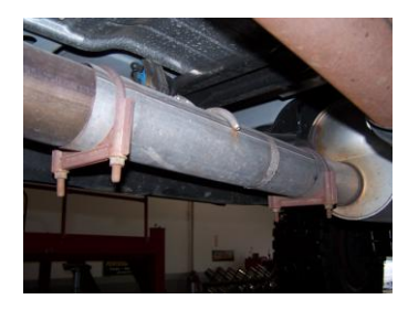
3. Remove the rest of your stock exhaust from the 2nd clamp located in front of your stock muffler.

6. Install band clamp #C onto muffler. Inset hangers into rubber grommets. Use bolt kit #E to secure band clamp to muffler. Do not tighten.