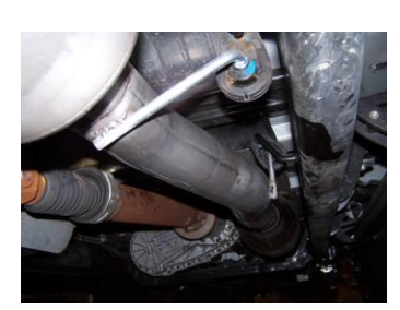
5. Install muffler #B onto head pipe #A 11/2"-2" with the louvers facing towards the converter. Use a jack stand to support the muffler. Use clamp #D to secure the muffler to the head pipe. Do not tighten. Muffler inlet is looking into the louvers.

8. Install stainless steel tip. Clamp down. When you have everything in place, firmly tighten all bolts and clamps down securely. Use stainless steel cleaner and a Scotch Brite pad weekly to prevent tip from discoloration. Inspect all fasteners after 25-50 miles of operation and re-tighten as necessary. You may need to cut your stock tail pipe back to get your tip to fit correctly.