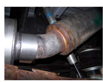
7. Re-install your factory tail pipe. Use clamp #D to secure pipe to muffler. Do not tighten. Insert hanger into rubber grommet.