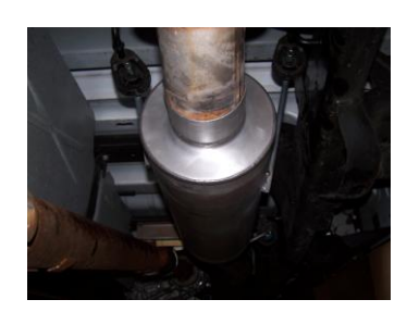
4. Install head pipe #A onto factory pipe. Use clamp #D to secure pipes together. Insert welded hangers into rubber grommets. Do not tighten.