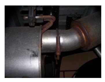
2. Remove your stock tail pipe from stock muffler by removing the clamp located on the outlet of muffler. Do not cut or damage your factory tail pipe you will re-use it. Leave all rubber grommets on the factory hangers on the vehicle.

1. Disconnect the negative battery cable before removal of OEM exhaust. This will allow the computer to reset and recognize the new exhaust. Lay out the exhaust on the floor so it looks like the drawing and compare parts with manual.