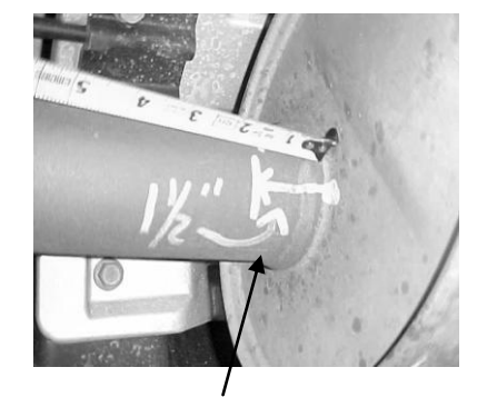
Cut here to remove for 00-02

INSTALL MUFFLER # B ONTO HEADPIPE WITH INLET TOWARDS CONVERTER USING CLAMP #E. USE A JACK STAND TO SUPPORT THE MUFFLER. MAKE SURE THE MUFFLER IS LEVEL. THE OUTLET OF THE MUFFLER WILL BE AT ABOUT 7 TO 8 O'CLOCK. THE MUFFLER INLET WILL BE LOOKING INTO THE LOUVERS TOWARDS THE MOTOR. ATTACH HANGER #D TO OUTLET OF MUFFLER AND INSERT INTO WELDED HANGER.