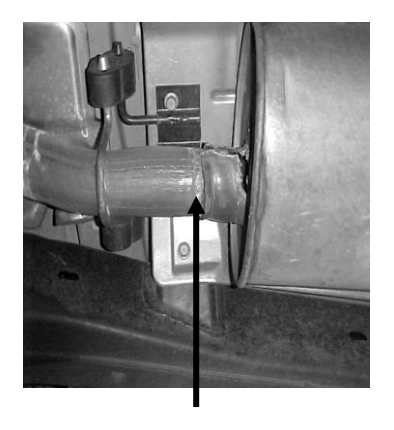
Remove here for 98-99

9/16" SOCKET + WRENCH, \frac{1}{2} " SOCKET + WRENCH, HACK SAW, JACK STAND, 15MM SOCKET, WD-40