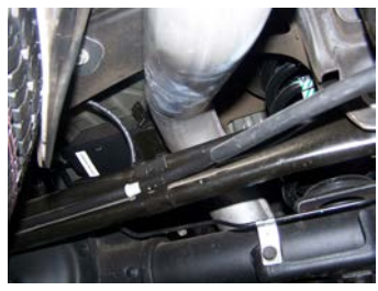
6. Install tailpipe #C into muffler 1½-2" and secure with clamp #F. DO NOT TIGHTEN. Insert welded hanger into rubber grommet.