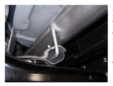
Install down pipe #A onto turbo and secure with factory clamp. DO NOT TIGHTEN. Insert welded hanger into bottom hole of rubber grommet.

Install the over axle tail pipe #D into the muffler 1\frac{1}{2}-2^{"} . Secure to muffler using clamp #F. DO NOT TIGHTEN.