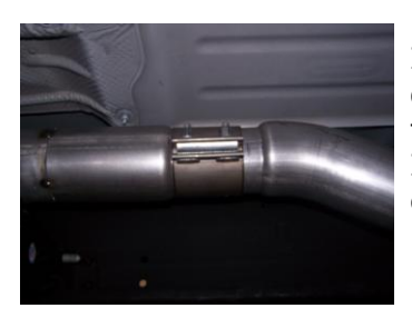
Install head pipe #B onto down pipe using factory clamp to secure. DO NOT TIGHTEN. Insert hanger into rubber grommet.

Install stainless steel tip. Clamp down. When you have everything in place, firmly tighten all bolts and clamps down securely. To clean stainless steel tips, use stainless steel cleaner and a Scotch Brite pad.