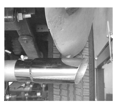
INSTALL THE STAINLESS STEEL TIP NOW; FIRMLY TIGHTEN EVERYTHING ALL CLAMP, HANGERS, BOLTS AND FLANGE. TO CLEAN TIP USE ANY STAINLESS OR ALUMINUM CLEANER WITH A SCOTT BRITE PAD.

MAKE SURE YOU HAVE A 1" CLEARANCE AWAY FROM ALL BRAKE LINES, FUEL LINES, SHOCKS, TIRES, ETC.