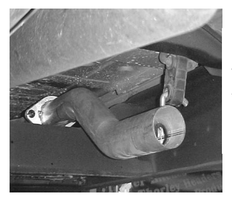
BOLT HEADPIPE #A TO THE STOCK FLANGE RE-USING THE FACTORY NUTS, BOLTS AND GASKET # H. INSERT WELDED HANGER INTO RUBBER GROMMET.

INSTALL OVERAXLE TAILPIPE #C TO THE OUTLET OF THE MUFFLER USING HANGER #G. INSERT WELDED HANGER INTO RUBBER GROMMET.