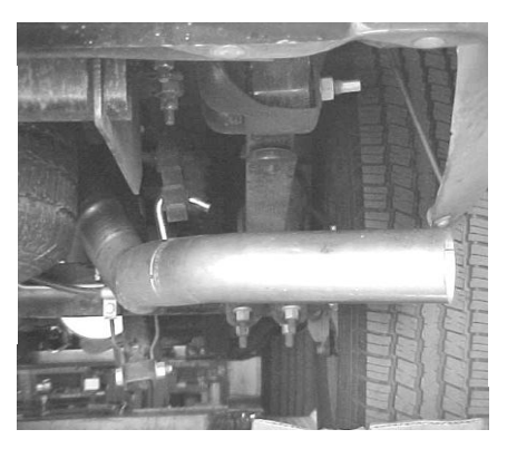
INSTALL TURNOUT PIPE #D INTO OVERAXLE TAILPIPE USING CLAMP# F. ROTATE EXIT PIPE UNTIL IT IS AT THE CORRECT ANGLE FOR YOUR TRUCK.