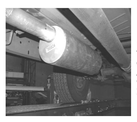
NEXT, CONNECT THE MUFFLER # B TO THE HEADPIPE USING CLAMP # F. USE JACKSTAND TO SUPPORT THE MUFFLER. THE OUTLET OF THE MUFFLER WILL BE AT APPROXIMATELY 9 O'CLOCK. THE MUFFLER INLET IS LOOKING INTO THE LOUVERS.