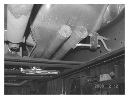
BOLT HEADPIPE #A USING SUPPLIED FLANGE GASKET #H AND REUSING FACTORY BOLTS. APPLY A SMALL A MOUNT OF HIGH-TEMP O2 SENSOR SAFE SILICONE ON THE FLANGE TO PREVENT ANY LEAKS. INSERT WELDED HANGER INTO RUBBER GROMMET. DO NOT TIGHTEN

INSTALL THE OVERAXLE TAILPIPE #C INTO MUFFLER AT LEAST 1 1/2" TO 2" USING CLAMP #G. DO NOT TIGHTEN. INSERT WELDED HANGERS INTO RUBBER GROMMETS. THE SPARE TIRE ON SOME VEHICLES MAY NEED TO BE LOOSENED AND PULLED TO THE DRIVER SIDE AND RE-TIGHTENED. ROTATE PIPES UNTIL YOU HAVE AT LEAST A 1" CLEARANCE AWAY FROM ALL SHOCKS AND LEAF SPRINGS.