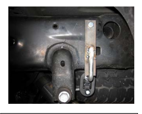
5. Next install drivers side rear hanger and grommet with bolt kit on the outside of the driver side frame rail. Use the factory drilled hole just forward of the large hole seen in the photo above.