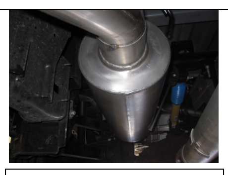
3. Install muffler #B onto headpipe 1.5" to 2" muffler outlets should be on top and level use clamp #G to secure together. Do not tighten. Insert hangers into rubber grommets