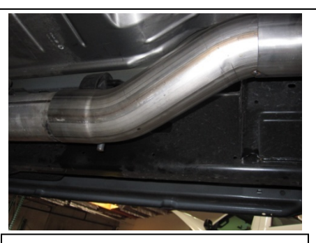
2.Install headpipe #A onto your factory pipe using clamp #G insert welded hanger into the rubber grommet leave clamp loose.

1. Disconnect the negative battery cable before removal of the OEM Exhaust. This will allow the computer to reset and recognize the new exhaust. Lay out the exhaust on the floor so it looks like the drawing and compare parts with manual. Remove the factory exhaust by cutting behind the factory muffler. Once the tail pipe has been removed un-bolt the muffler and head pipe at the clamp located in front of the factory muffler. Use wd-40 or another type of penetrating oil to remove the rubber grommets. Do not damage these they will be re used.