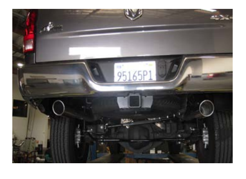
7. Install exit pipes #E onto tailpipes use clamp # F to secure together. After everything is installed begin to tighten all connections starting from the furthest forward connection. Items will move as you tighten. Be sure to check all clearance.

"MAKE SURE YOU HAVE A 1" CLEARANCE ON ALL PIPES FROM ALL RUBBER BRAKE LINES, SHOCK BOOTS, TIRES, ETC..." TORQUE ALL CLAMPS TO APPROX. 100 TO 150 FT LBS.