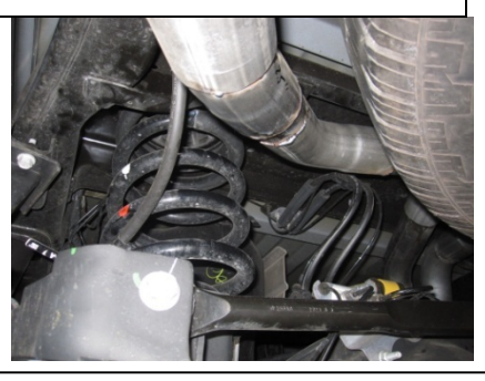
4.Next install Drivers side overaxle tailpipe #C into muffler 1.5" to 2" use clamp #F to secure pipe to muffler do not tighten