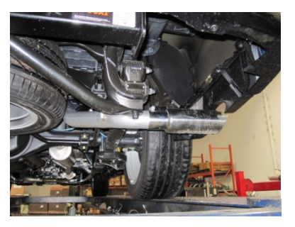
NEXT INSTALL REAR MUFFLER HANGER #G ONTO OUTLET OF MUFFLER. INSERT WELDED HANGER INTO RUBBER GROMMETS