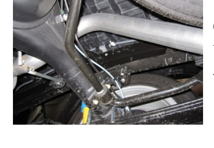
INSTALL THE OVERAXELE TAILPIPE #C INTO THE MUFFLER 1-1/2" TO 2". DO NOT TIGHTEN.

INSTALL HEAD PIPE #A ON TO YOUR EXISTING STOCK 2-BOLT FLANGE AND SECURE WITH BOLT KIT #F. INSERT WELDED HANGER INTO RUBBER GROMMET. DO NOT TIGHTEN.