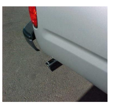
NEXT INSTALL YOUR STAINLESS STEEL TIP TO YOUR DESIRED LOOK. USE ANY ALUMINMUM OR STAINLESS STEEL CLEANER TO POLISH YOUR TIP. MAKE SURE YOU HAVE A MINIMUM OF A 1" CLEARANCE ON ALL PIPES FROM ALL RUBBER BRAKE LINES, TIRES, SHOCKS, FUEL LINES, ETC. THEN TIGHTEN ALL CLAMPS AND HANGERS

SLIP MUFFLER #B ONTO HEADPIPE NO MORE THEN 2" AND NO LESS THEN 1". ATTACH TO HEADPIPE WITH CLAMP #F. THE MUFFLER INLET WILL HAVE THE INSIDE LOUVERS FACING FORWARD. THE OUTLET OF THE MUFFLER WILL BE POSITIONED AT 12 O'CLOCK. USE A JACK STAND TO SUPPORT THE MUFFLER. THE MUFFLER INLET IS LOOKING INTO THE LOUVERS.