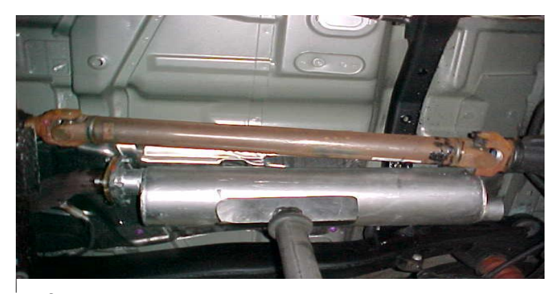
3. INSTALL THE MUFFLER # A TO THE STOCK FLANGE USING BOLT KIT # F AND GASKET # E WE SUGGEST USING A HIGH TEMP GASKET SEALER ON THE STOCK GASKET WHEN REINSTALLING. USE JACKSTANDS TO SUPPORT THE MUFFLER. INSTALL HANGER #D IN REAR RUBBER GROMMETS NEAR THE OUTLET OF THE MUFFLER.