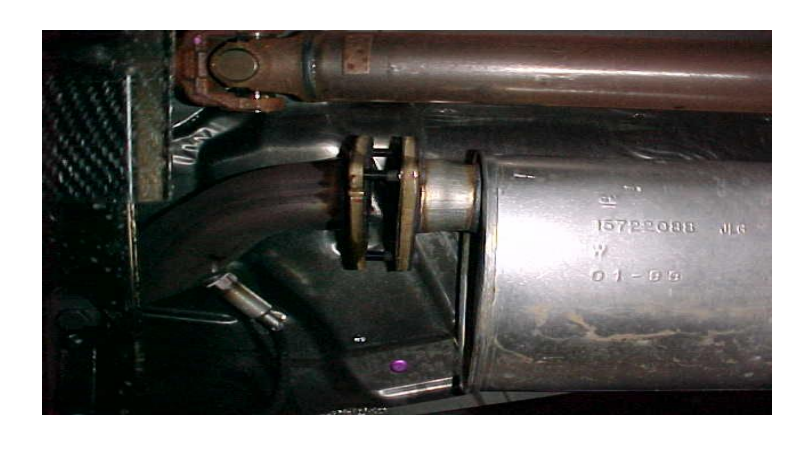
2. UNBOLT STOCK MUFFLER FLANGE AT THE STOCK CONVERTER. REMOVE THE STOCK MUFFLER. MAKE SURE ALL RUBBER GROMMETS ARE STILL IN PLACE.