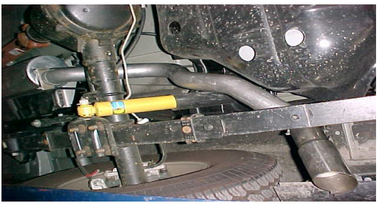
4. INSTALL TAILPIPE #B AND INSERT WELDED HANGER INTO RUBBER GROMMETS AND THEN INSERT IT INTO THE REAR OF THE MUFFLER. AND ATTACH WITH HANGER #D. INSTALL THE STAINLESS TIP. TO CLEAN USE ANY STAINLESS OR ALUMINUM CLEANER..