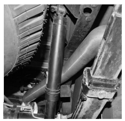
INSTALL TAILPIPE #C ONTO MUFFLER 1-1/2" TO 2". THE TAILPIPE WILL GO BETWEEN TIRE AND SHOCK, INSTALL FROM THE REAR OF THE VEHICLE. INSERT WELDED HANGER INTO THE RUBBER GROMMET. AND ATTACH WITH HANGER # E.

TO REMOVE STOCK EXHAUST UN-BOLT IT FROM THE 2-BOLT FLANGE LOCATED BETWEEN THE CATALYTIC CONVERTER AND THE MUFFLER. NOW CUT OFF YOUR STOCK TAILPIPE JUST BEHIND THE MUFFLER AND REMOVE. LEAVE ALL RUBBER GROMMETS ON THE HANGER. USE WD-40 TO AID IN REMOVAL OF EXHAUST AND HANGERS. INSTALL HEADPIPE #A, USE # G GASKET, AND RE-USE YOUR FACTORY BOLTS. DO NOT TIGHTEN.