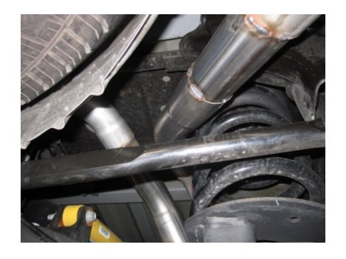
6.Next install passenger side tailpipe # D into muffler 1.5"to 2" insert welded hangers into rubber grommets use clamp #F to secure pipe together do not tighten