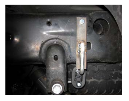
5. Next install drivers side rear hanger and grommet with bolt kit on the outside of the driver side frame rail. Use the factory drilled hole just forward of the large hole seen in the photo above.