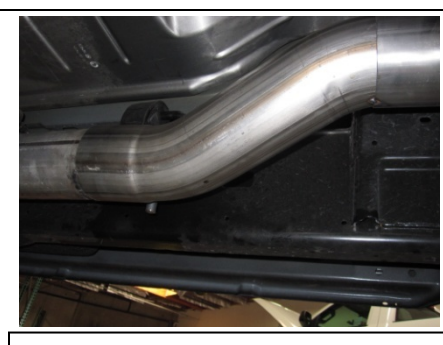
2.Install headpipe #A onto your factory pipe using clamp #G insert welded hanger into the rubber grommet leave clamp loose.

1. Disconnect the negative battery cable before removal of the OEM Exhaust. This will allow the computer to reset and recognize the new exhaust. Lay out the exhaust on the floor so it looks like the drawing and compare parts with manual. Remove the factory exhaust by cutting behind the factory muffler. Once the tail pipe has been removed un-bolt the muffler and head pipe at the clamp located in front of the factory muffler. Use wd-40 or another type of penetrating oil to remove the rubber grommets. Do not damage these they will be re used.