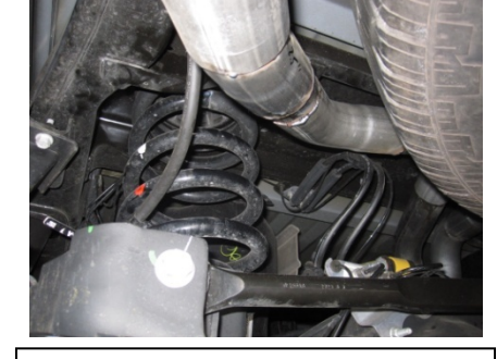
4.Next install Drivers side overaxle tailpipe #C into muffler 1.5" to 2" use clamp #F to secure pipe to muffler do not tighten

3. Install muffler #B onto headpipe 1.5" to 2" muffler outlets should be on top and level use clamp #G to secure together. Do not tighten. Insert hangers into rubber grommets