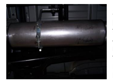
3. Install muffler #B onto head pipe 1\frac{1}{2} "-2" with the louvers facing towards the converter. Use a jack stand to support the muffler. Use clamp #G to secure the muffler to the headpipe. DO NO TIGHTEN. Muffler inlet is looking into the louvers.