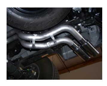
7. Attach tailpipes together with bolt kits #I. DO NOT TIGHTEN. Driver side tabs will be on bottom.