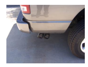
11. Install stainless steel tips #E. Clamp down. When you have everything in place, firmly tighten all bolts and clamps down securely. Use stainless steel cleaner and a Scotch Brite pad weekly to prevent tip from discoloration.