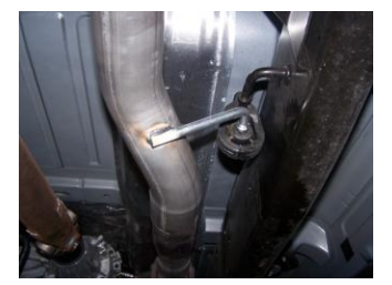
2. Install head pipe #A onto your existing stock front pipe and attach with clamp #G. Use a jack stand to support the converter. Insert welded hanger into rubber grommet.

5. Install the passenger side overaxle tailpipe #D into the muffler 1½"-2". Use clamp #F to secure tailpipe to muffler. DO NOT TIGHTEN. Insert welded hanger into rubber grommet.