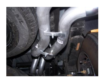
6. Install the driver side overaxle tailpipe #C into the muffler 1\frac{1}{2} "-2". Use clamp #F to secure tailpipe to muffler. DO NOT TIGHTEN.