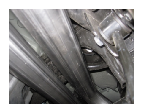
5.Next install the drivers side tailpipe into the muffler 1.5"-2"