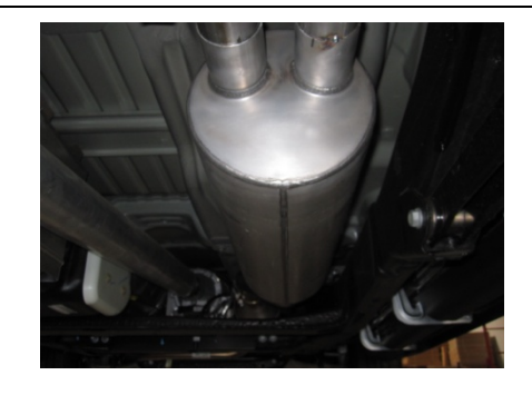
3. Install muffler #B onto headpipe 1.5" to 2" muffler should be level use clamp #E to secure together do not tighten.