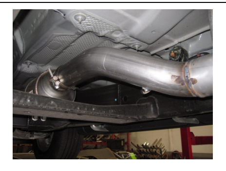
2.Install headpipe #A onto your factory pipe using your stock clamp insert welded hanger into the rubber grommet leave clamp loose.

1. Disconnect the negative battery cable before removal of the OEM Exhaust. This will allow the computer to reset and recognize the new exhaust. Lay out the exhaust on the floor so it looks like the drawing and compare parts with manual. Remove the factory exhaust by cutting behind the factory muffler. Once the tail pipe has been removed un-bolt the muffler and head pipe at the clamp located in front of the factory muffler. Use wd-40 or another type of penetrating oil to remove the rubber grommets. Do not damage these they will be re used.