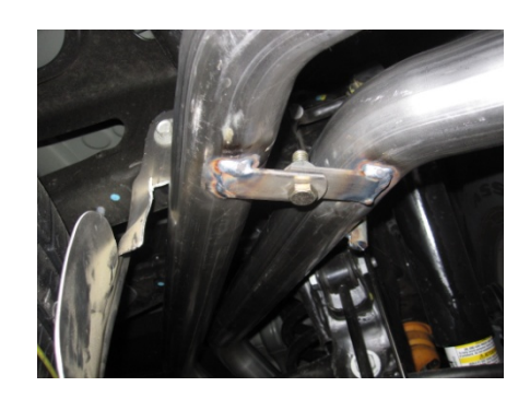
6.Once tailpipes are installed use bolt kit #H to secure pipes together the driver side tab will be on the bottom.