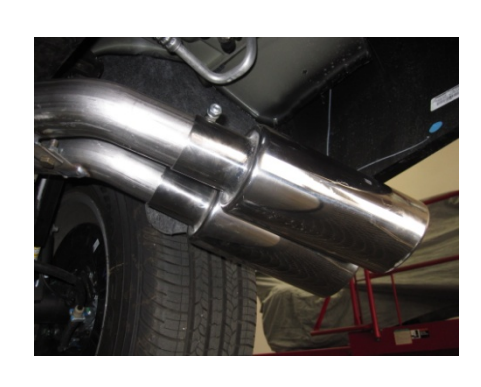
7. Install your tips to your desired look.

"MAKE SURE YOU HAVE A 1" CLEARANCE ON ALL PIPES FROM ALL RUBBER BRAKE LINES, SHOCK BOOTS, TIRES, ETC..." TORQUE ALL CLAMPS TO APPROX. 100 TO 150 FT LBS.