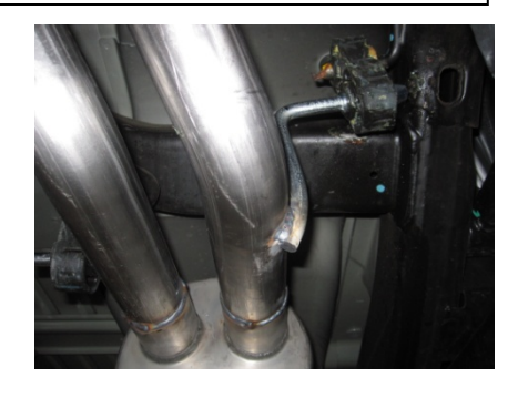
4.Next install passenger side overaxle tailpipe #C into muffler 1.5" to 2" insert welded hanger into rubber grommet use clamp # F to secure pipe to muffler do not tighten