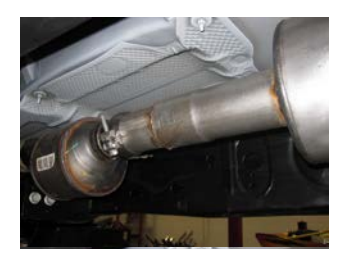
3. Install the muffler assembly onto the factory dome 2". Use a jack stand to support the muffler assembly. Use your factory clamp to secure muffler assembly to the dome. Do not tighten. Insert welded hangers into rubber grommets.

4. Rotate the muffler assembly until the outlets are level.