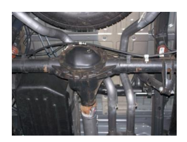
7. Install passenger side tailpipe #C into muffler at least 1.5" to 2". Use clamp #G to secure pipe to muffler. Do not tighten. The tailpipes will both lean towards the driver side for clearance. Insert welded hangers into rubber grommets.