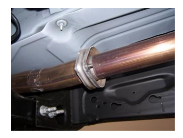
2. To remove stock exhaust, unbolt it at the flange behind the Y-pipe. Make sure to leave all rubber grommets in the factory location. You will re use stock nuts and bolts. For easier removal of exhaust, cut behind the muffler. Use WD-40 to remove hangers from grommets.

1. Disconnect the negative battery cable before removal of OEM exhaust. This will allow the computer to reset and recognize the new exhaust. Lay out the exhaust on the floor so it looks like the drawing and compare parts with manual.