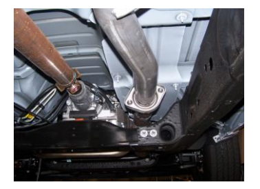
3. 2009/2010 Models Only You will use part "N" to attach to the muffler re-using the factory clamp. Be sure that the tabs of the clamp are straight. If they are bent, it will not seal the connection.

6. Install driver side tailpipe #D into muffler at least 1.5" to 2". This pipe will route over the axle and between the shock and spare tire. Use clamp #G to secure pipe to muffler. Do not tighten. Insert welded hangers into rubber grommet.