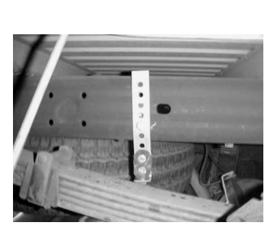
Remove the stock rear hanger from frame on passenger side. Install hangers # H to the frame using existing bottom hole where the stock hanger was mounted. Use the supplied nuts and bolts and mount the hanger through the fifth hole down from the top of the hanger. Repeat on the driver side.

Install exit pipes # E onto the over axle pipes and attach with clamp #G. You may need to cut the exit pipes to your preference. Rotate all pipes until you have a minimum of a 1" clearance on all pipes. Use zip ties for brake lines. Tighten all clamps, flanges, and bolts firmly. Install stainless steel tips. Use zip ties for brake and fuel lines.