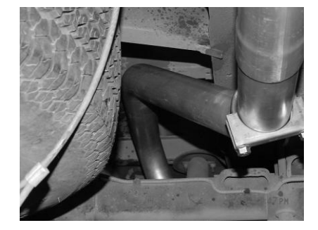
INSTALL PASSENGER SIDE TAILPIPE #C INTO MUFFLER 1-1/2" TO 2" USING CLAMP #I THEN ATTACH WITH CLAMP #H AND ATTACH TO MUFFLER. ATTACH HANGERS #I TO BOTH TAILPIPES. ATTACH WITH CLAMP #H. DO NOT TIGHTEN.