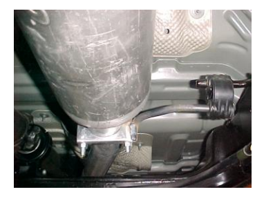
Next install front muffler hanger #F onto muffler. Insert hanger into rubber grommets. Do not tighten.

Install exit pipes # E onto tailpipe, use clamps # H to secure pipes together, do not tighten.