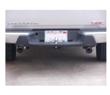
Install stainless steel tip. Clamp down. When you have everything in place, firmly tighten all bolts and clamp down securely. To clean stainless steel tip use any stainless steel cleaner and Scotch Brite pad.