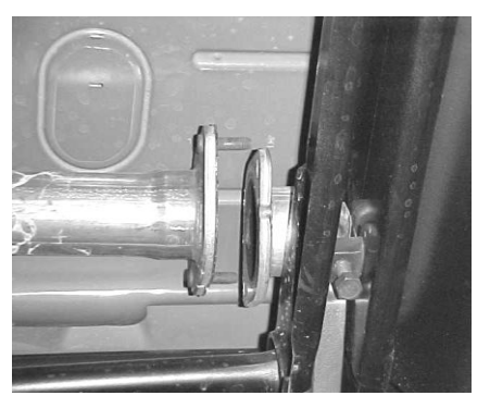
AFTER CUTTING THE TAILPIPE. UNBOLT THE STOCK HEADPIPE AND REMOVE THE WHOLE SYSTEM.LEAVE ALL RUBBER GROMMETS IN PLACE. YOU WILL RE-USE THE FACTORY BOLTS. BEFORE REMOVING. MAKE SURE YOU SUPPORT THE CATALITIC CONVERTER IN THE STOCK POSITION