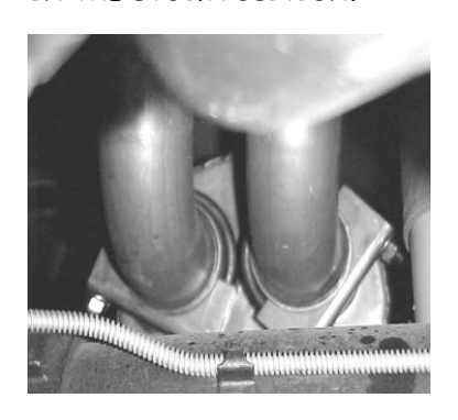
INSTALL TAILPIPES # C & D USE CLAMP#G ON THE PASSENGER SIDE AND HANGER #I ON THE DRIVER SIDE, INSERT WELDED HANGER INTO RUBBER GROMMET. USE BOLT KIT#H TO CONNECT BOTH THE TAILPIPES TOGETHER.