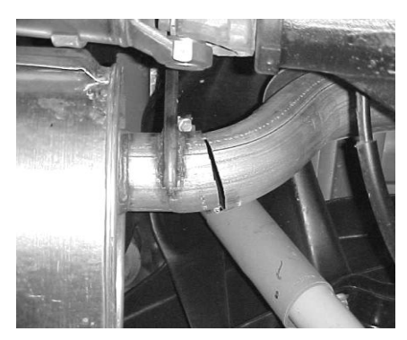
LAYOUT THE GIBSON EXHAUST AS SHOWN ON YOUR MANUAL. COMPARE THE PIPE NUMBERS TO THE MANUAL NUMBERS, MAKE SURE THEY ALL MATCH. THEN, CUT THE STOCK TAILPIPE OFF JUST AFTER THE MUFFLER FOR EASY REMOVAL.