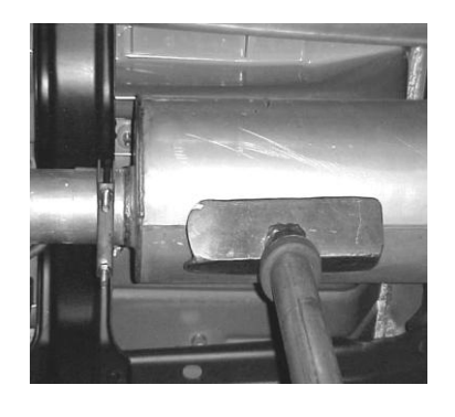
INSTALL MUFFLER # B ONTO HEADPIPE #A 12" TO 2". THE INLET WILL BE AT APPROXIMATELY 6 O'CLOCK, CONNECT THE MUFFLER TO HEADPIPE#A USING CLAMP#F. INSERT WELDED HANGER INTO RUBBER GROMMET.