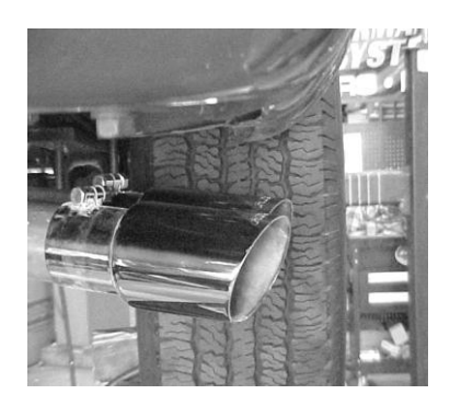
NOW INSTALL YOUR STAI NLESS STEEL TIPS TO YOUR DESIRED LOOK, USE ANY ALUMINUM OR STAINLESS STEEL CLEANER TO POLISH YOUR TIP. THEN TIGHTEN ALL CLAMPS AND HANGERS.

YOU HAVE A MINIMUM OF A 1 1/2" CLEARANCE FROM ALL RUBBER BRAKE LINES, TIRES, SHOCKS, FUEL LINES, ETC.