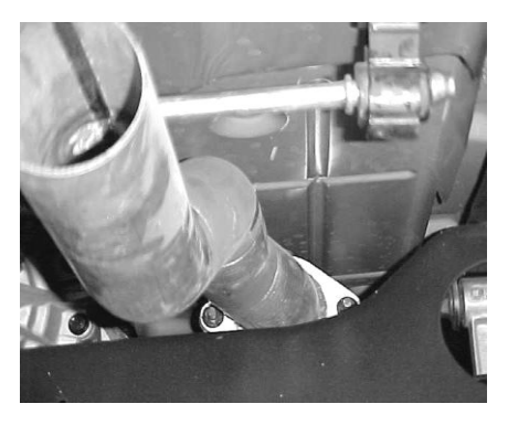
NEXT, CONNECT HEADPIPE#A TO THE STOCK FLANGE. RE-USE STOCK NUTS AND GASKET # J.