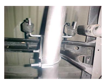
Next install rear muffler hanger# D into grommets just above the outlet of the muffler clamp onto tailpipe. Do not tighten.

Install head pipe # A on to your existing stock front pipe and secure with clamp # G.