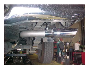
Install the over axle tailpipe # C into the muffler 1-1/2" to 2". Secure to the muffler using clamp #F Do not tighten. Insert welded hanger into rubber grommet.

Lay out the exhaust on the floor so it looks like the drawing and compare parts with manual. To remove the stock exhaust Cut it 17 1/2" in front of the muffler. Leave all rubber grommets in place. Use WD-40 to aid in removal of exhaust and hangers.