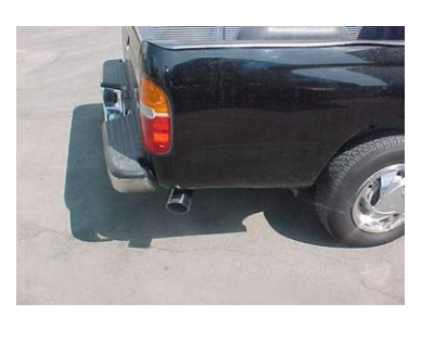
Install stainless steel tip. Clamp down. When you have everything in place, firmly tighten all bolts and clamp down securely. To clean stainless steel tip use any stainless steel cleaner and Scotch Brite pad.

Install muffler #B onto head pipe 1-1/2" to 2" with the louvers facing towards the converter. Use a jack stand to support the muffler. Use clamp #F to secure the muffler to the head pipe. Do not tighten. Muffler inlet is looking into the louvers.