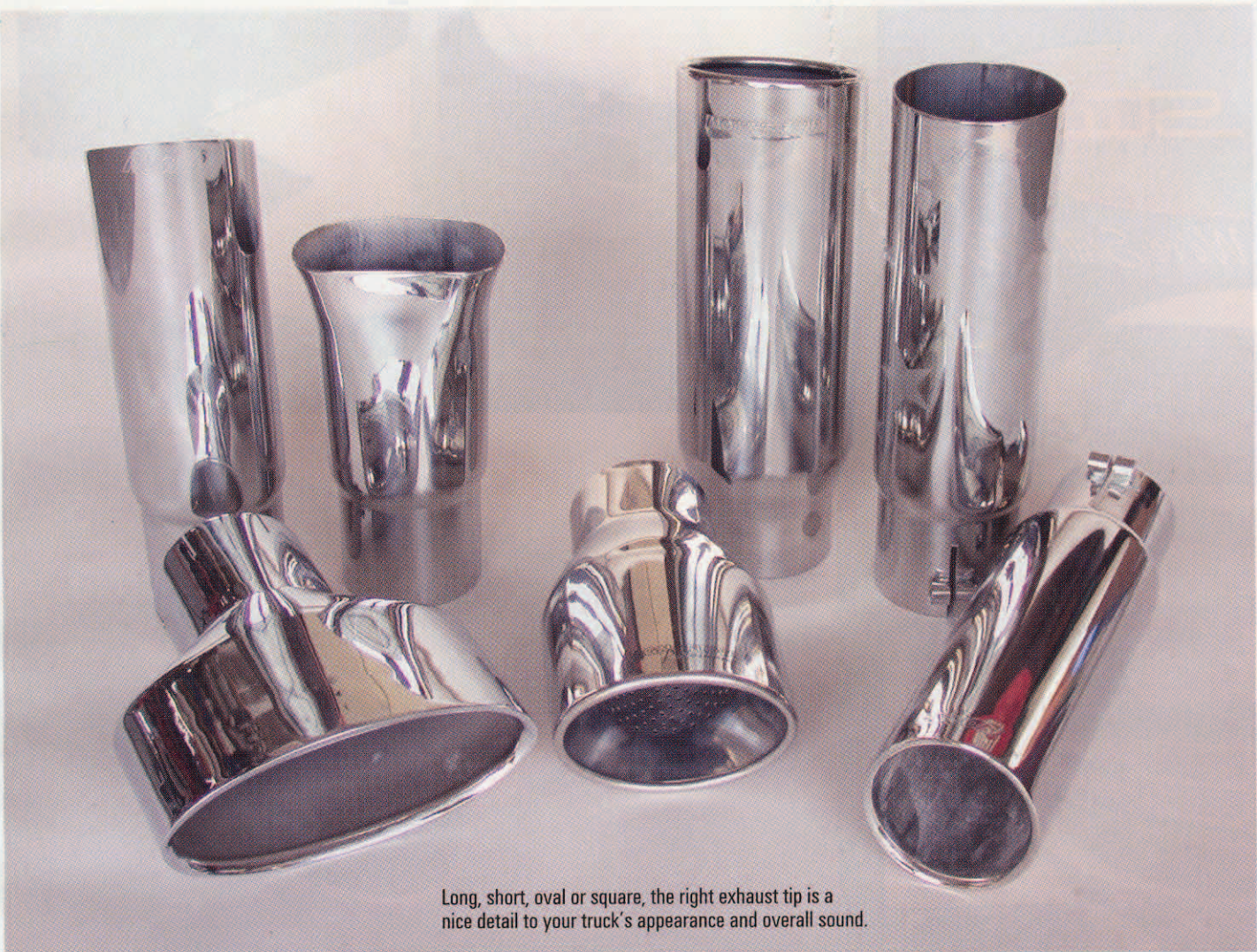
Long, short, oval or square, the right exhaust tip is a nice detail to your truck's appearance and overall sound.