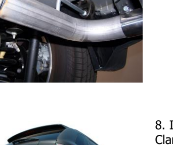
5. Install extension pipe #C onto muffler outlet. Use clamp #H to secure the pipe to the muffler. Insert welded hanger into rubber grommet.