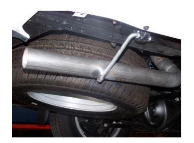
7. Install the exit pipe #D onto the tailpipe. Secure together with clamp #F. Do not tighten. Roll the exit pipe until it is at the correct angle for your vehicle. Insert welded hanger into rubber grommet.