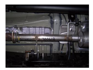
3. Install headpipe #A onto your existing stock 2-bolt flange. Use bolt kit #G to secure. Do not tighten. Insert welded hangers into rubber grommets.

5. Install the over axle tailpipe #C into the muffler 1.5-2". Secure to the muffler using clamp #F. Do not tighten. Insert welded hanger into rubber grommet.