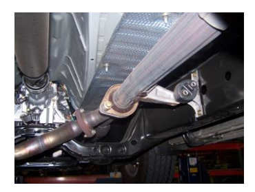
2. To remove the stock exhaust, unbolt the 2-bolt flange just in front of the muffler. Then cut your tailpipe off behind the muffler. Leave all rubber grommets on the factory hangers on the vehicle.

1. Disconnect the negative battery cable before removal of OEM exhaust. This will allow the computer to reset and recognize the new exhaust. Lay out the exhaust on the floor so it looks like the drawing and compare parts with manual.