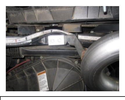
4. With the springs installed and the exhaust in the desired position mark the holes on the frame for the tailpipe hangers. You can either drill the holes and through bolt or use the provided self tapping screws.