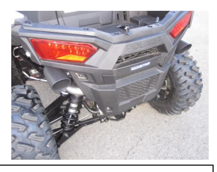
7. Once everything has been installed Double Check all connections install your exhaust tips. Be sure there is a 1" clearance from all major components. Then go have fun.

"MAKE SURE YOU HAVE A 1" CLEARANCE ON ALL PIPES FROM ALL RUBBER BRAKE LINES, SHOCK BOOTS, TIRES, ETC..."