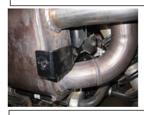
5. Install the provided heat shield bracket's into the factory locations re using the factory bolts to attach it to the frame on both driver and passenger sides.