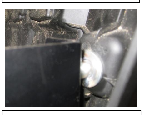
7. With all brackets in place and muffler completely installed begin re installing the rear heat shield and factory cover. You will install the heat shield with the bolt holes at the bottom closest to the muffler. The provided spacers will be placed between the heat shield and factory cover.