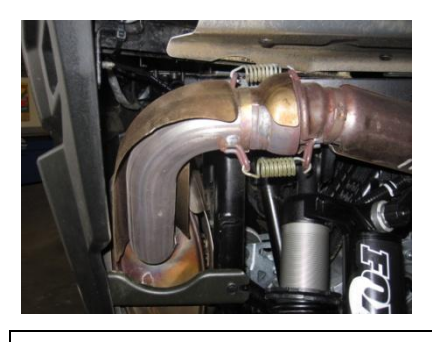
2. Once you have removed the factory plastics off the rear now you can remove your factory exhaust.

1. Disconnect the negative battery cable before removal of the OEM Exhaust. This will allow the computer to reset and recognize the new exhaust. Lay out the exhaust on the floor so it looks like the drawing and compare parts with manual. Remove the factory exhaust by un bolting the factory rear plastic valance You will re use the hardware for the Gibson install. Dis-connect the 4 factory springs and remove the factory exhaust. Do not damage the factory exhaust gasket and springs. You will re use this gasket and springs.