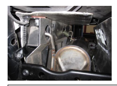
3. Next install the Gibson Muffler assembly. Install the bottom hanger mounts first then slide the inlet over the factory head pipe re using the factory gasket and springs.