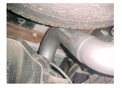
Install the over axle tailpipe # B into the muffler 1-1/2" to 2". Secure to the muffler using clamp # F. Do not tighten. Insert hanger into rubber grommet.

Lay out the exhaust on the floor so it looks like the drawing and compare parts with manual. To remove the stock exhaust remove it just in front of the stock muffler. You may need to heat it up for easier removal. Leave all rubber grommets in place. Use WD-40 to aid in removal of exhaust and hangers.