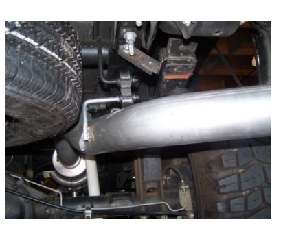
SLIDE EXIT PIPE # E ONTO OVERAXLE TAILPIPE INSERT WELDED HANGER INTO RUBBER GROMMET. USE CLAMP # I TO SECURE PIPES TOGETHER. DO NOT TIGHTEN. ROTATE PIPE UNTIL LEVEL.

SLIDE PASSENGER SIDE HEADPIPE #A ONTO STOCK HEADPIPE. INSERT WELDED HANGER INTO RUBBER GROMMET. NEXT, INSTALL DRIVERS SIDE HEADPIPE #B ONTO STOCK HEADPIPE, USE CLAMP #H TO SECURE BOTH HEADPIPES, DO NOT TIGHTEN.