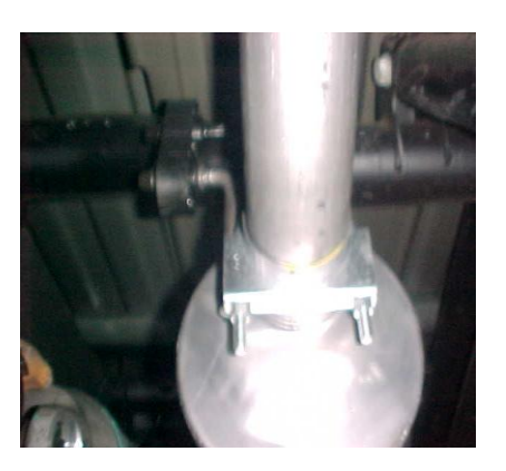
INSTALL REAR MUFFLER HANGER # G ONTO OUTLET OF MUFFLER. INSERT HANGER INTO RUBBER GROMMET.

REMOVE YOUR STOCK EXHAUST FROM THE FACTORY FLANGES LOCATED JUST BEHIND YOUR FACTORY Y-PIPE, NEXT CUT OFF YOUR TAILPIPE JUST BEHIND THE MUFFLER. USE WD-40 TO AID IN REMOVAL OF RUBBER GROMMETS FROM HANGERS.