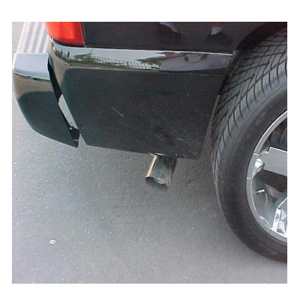
INSTALL YOUR STAINLESS TIP TO YOUR DESIRED LOOK. NOW GO BACK AND TIGHTEN ALL NUTS, BOLTS, AND CLAMPS.

INSTALL MUFFLER # C ONTO HEADPIPES 1 ½"-2". USE CLAMPS # F TO SECURE OUTLET OF MUFFLER, IT SHOULD BE AT THE 12 O'CLOCK POSITION. USE A JACKSTAND TO SUPPORT MUFFLER.