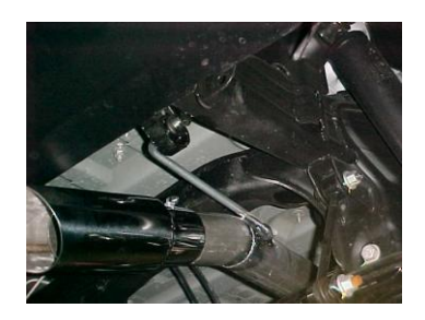
Install the over axle tailpipe # D into the muffler 1-1/2" to 2". Insert welded hanger into rubber grommet.

Lay out the exhaust on the floor so it looks like the drawing and compare parts with manual. To remove the stock exhaust remove it from the stock flange & slip joint located in front of the muffler, then cut off your tailpipe just behind the muffler. Use WD-40 to aid in removal of hangers from grommets leave grommet on vehicle.