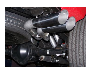
7. Use bolt kit #h to attach tailpipe tabs together.