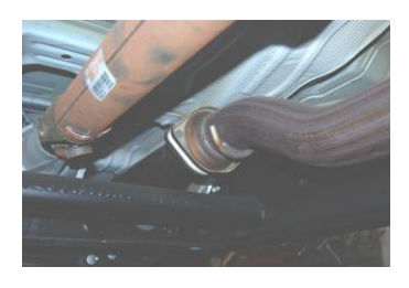
2. To remove your stock exhaust, unbolt the 2-bolt flange located in front of the muffler. Disengage the welded hangers from the rubber grommets. Use WD-40 to aid in this process. Do not remove or damage the rubber grommets as you will reuse them to mount your new system. Now, cut off tailpipe and remove exhaust. Do not throw away stock hardware.

1. Disconnect the negative battery cable before removal of OEM exhaust. This will allow the computer to reset and recognize the new exhaust. Lay out the exhaust on the floor so it looks like the drawing and compare parts with manual.